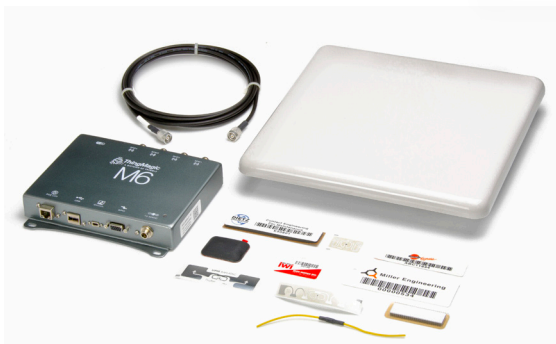
M6e Reader DevKit shown