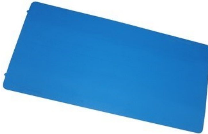
The A5530 Ground Mat